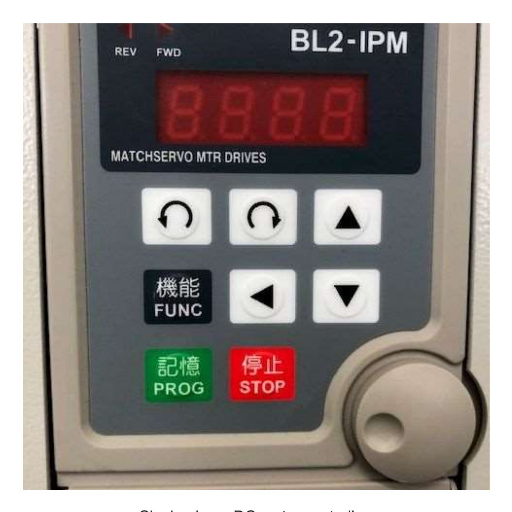
Single phase DC motor controller.

For more information or to arrange a demo contact us now on 09 828 3706 or by replying to this email.