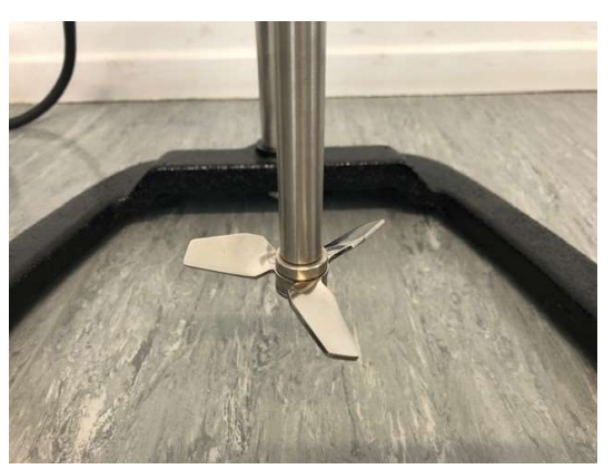
The 3 different emulsifying/mixing assemblies available, showing the interchangeable high shear disc and hydrofoil impeller in the lower 2 images.